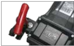
Release with key

* Duty Cycles depend on gate size and installation