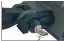
Release with special key (optional)