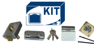
16700060 LOCK KIT 12V Electric lock Counter-plate for horizontal or vertical mounting external and internal cylinder